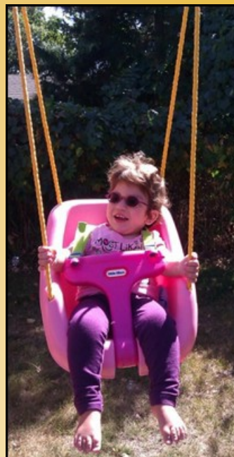
Grants can be for garden equipment

Whizz-Kidz provide essential mobility equipment to give young disabled people the independence to enjoy a more active childhood. Whizz-Kidz provides powered wheelchairs, manual wheelchairs, sports wheelchairs, trikes and buggies to give young people with a disability independence. Applications must be submitted before the child's 18th birthday. You can download the application form from their website, or can apply via a paper copy.