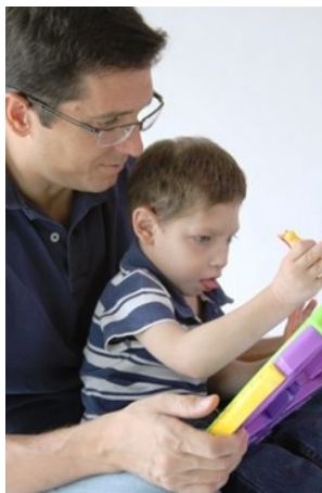
Help can be for everyday items

if you should find any new sources of funding that we haven't included, please contact Unique to tell us about them. We are always pleased to receive new information that we can pass on to carers of children with rare chromosome or genome disorders.